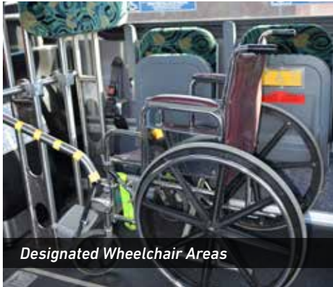
Designated Wheelchair Areas