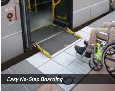
Easy No-Step Boarding