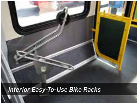
Interior Easy-To-Use Bike Racks